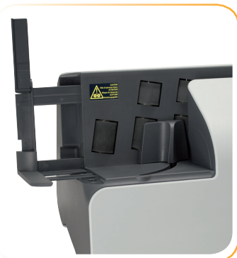
Easy-to-use support arm extends to hold large envelopes