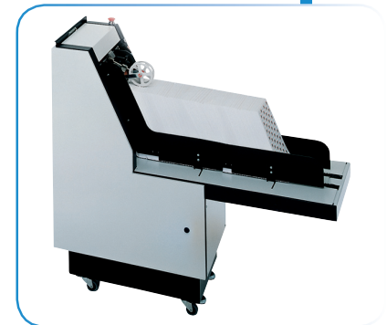
FD 2000-60 Bulk Input Loader (optional for FD 2094)